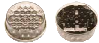
Optically enhanced LED Lamps

The 5", amber, PAR 46, LED lamp is a sophisticated, high-output, low-power-consumption, sealed-beam lamp with a life that is unparalleled by other conventional arrow board lamps. The lamp is backed by a five-year warranty.